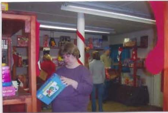
Choosing toys for the baby.