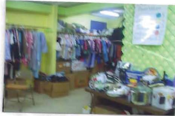
Household items and clothing displayed for "shoppers".