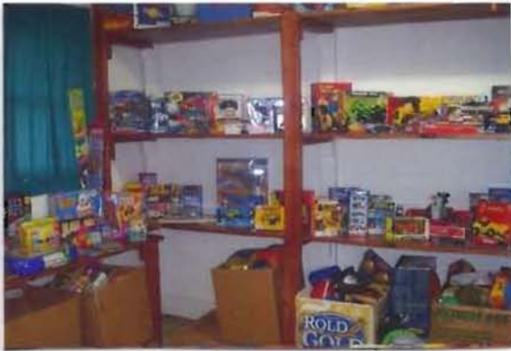
Toys and games are stocked.