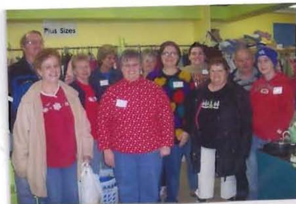
Santa's helpers. (Volunteers and employees.)